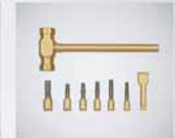
BRASS TOOLS & HAMMER WRENCH