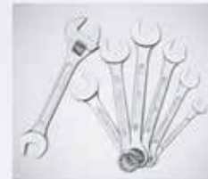
COMBINATION & RING SPANNERS