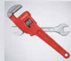
PIPE & ADJUSTABLE WRENCHES