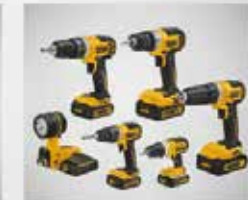
CORE CUTTER & MAGNETIC DRILL