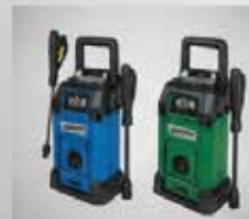
WATER PRESSURE PUMP