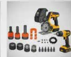
CORDLESS DRILL & BITS