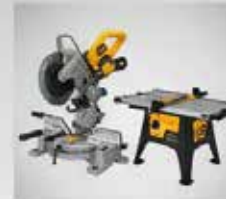
MITER & TABLE SAW