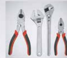
ALL KINDS OF PLIERS