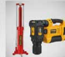
JACK & DEMOLITION HAMMER