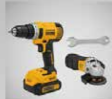
DRILL & GRINDER

Minsa Trading Company supplies a premium range of power tools engineered for high-performance, durability, and precision. Our extensive inventory features everything from professional-grade drills, grinders, and rotary hammers to heavy-duty machinery including asphalt cutters, compactors, and generators. Whether you require high-pressure washers, industrial fans, or reliable water pumps, our equipment is meticulously selected to ensure maximum efficiency and operational reliability for the most demanding construction and industrial applications.