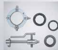
PULLERS & FILTER WRENCHES