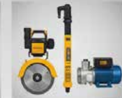
COMPACTOR & VIBRATOR