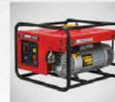
DIESEL & GENERATOR