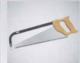
HAND SAW & HACK SAW