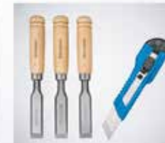
CHISEL & CUTTER