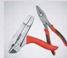
VICE GRIP & AVIATION SNIP