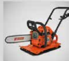
CHAIN SAW & ASPHALT CUTTER