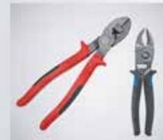
BOLT & CABLE CUTTER