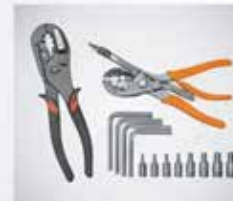
PLIERS & CRIMPING TOOLS