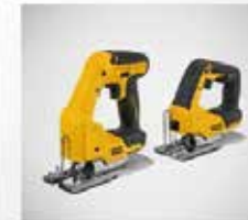
PLANNER & JIGSAW